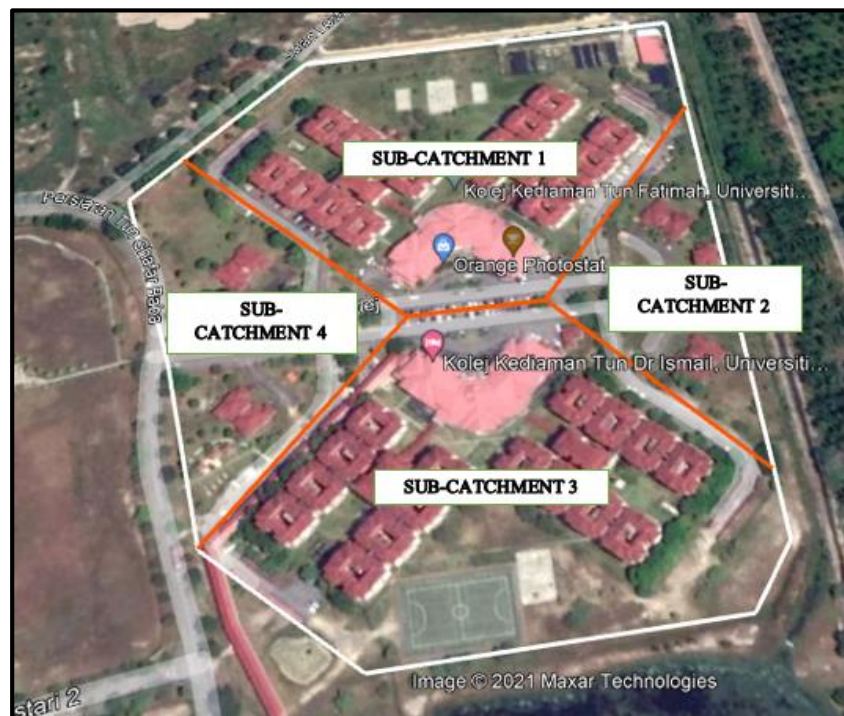
Figure 1: The sub-catchments division at the study area

The catchment area was calculated using Google Earth Pro application. The total catchment area obtained was 9 hectares. The land use in this particular area is for residential purposes. Therefore, the catchment area are consists of residential buildings, paved road, parking lots and etc. Furthermore, the catchment area is segmented into several sub-catchments based on its land use. The sub-catchments division at the study area is illustrate as in figure 1 and the area for each sub-catchment is shown in table 1. The sub-catchment areas were divided based on its landuse. According to Li C et al. (2020), sub-catchment division approach that takes into consideration land-use types. Sub-catchments 1 and 3 were divided by the land use purpose, which is for residential uses. However, land use for sub-catchment 2 and 4 were open space with grass cover.