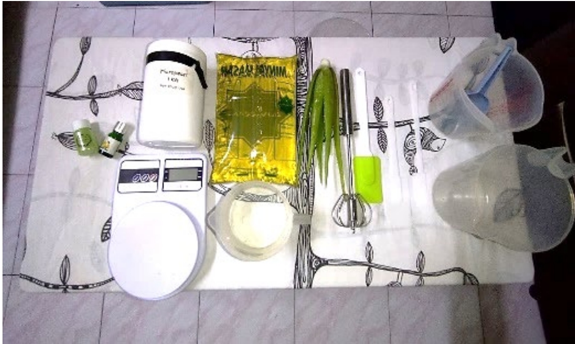
Figure 1: List of materials and apparatus that are used to produce An'Nur Homemade dishwashing soap