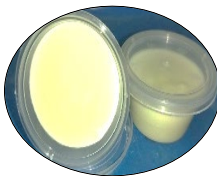
Figure 4: An'Nur Homemade dishwashing soaps ready and can be used

Dishwashing soap made from UCO with aloe vera mixed in could be produced after a month in storage at room temperature. It can be seen as in Figure 4 . The texture is solid, non-sticky and doesn't exude smell like cooking oil. Once testified by researchers, these soaps could remove stains and oil on the surface of plates and cooking utensils like pots and pans. Moreover, run tests had shown no rashness, itchiness and skin dryness upon applying the dishwashing soap. One of the researchers that has sensitive skin had shown no side-effects unlike those soaps from markets. This dishwashing soap produces lots of bubbles and has the fragrance of refreshing lemon. Upon the completion of run tests by researchers, the dishwashing soaps are given to respondents to identify their perceptions upon applying the dishwashing soap.