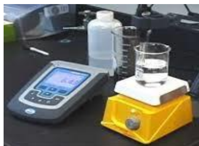
Figure 2 : pH Meter

Figure 2 shows the measurement of acidity of the fermented solution using pH Meter. The pH value was taken to determine the most effective fermented solution that acts as a cleaning agent. The lowest pH level is a key characteristic of cleaning products. Thus, the characteristics of a good cleaning agent are those with the lowest pH value.