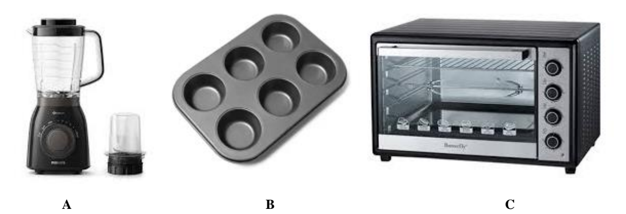
Figure 1: Instruments used in the production process

Corn and barley are the main ingredients of this product. The amount of water required has always been believed to be an important feature of the effectiveness of this product. The scarcity of moisture and fat in our products helps us to get a longer lifespan without the need for any additional preservatives' chemical. The combination within one substance to another corresponds to a specially defined ratio of 7:3 [5]. That is equalized to 7 parts of the grain and 3 parts of the water. It is very important to the success of a stronger and more sustainable product. Figure 1 shows the instruments used during this project production processes such as (a) blender, (b) Cupcake tray, (c) Oven.