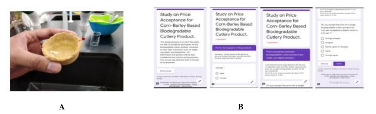
Figure 6: Other testing, such as (a) quality performance, and (b) price recognition survey.