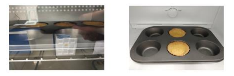
Figure 4: Testing of the temperature endurance.