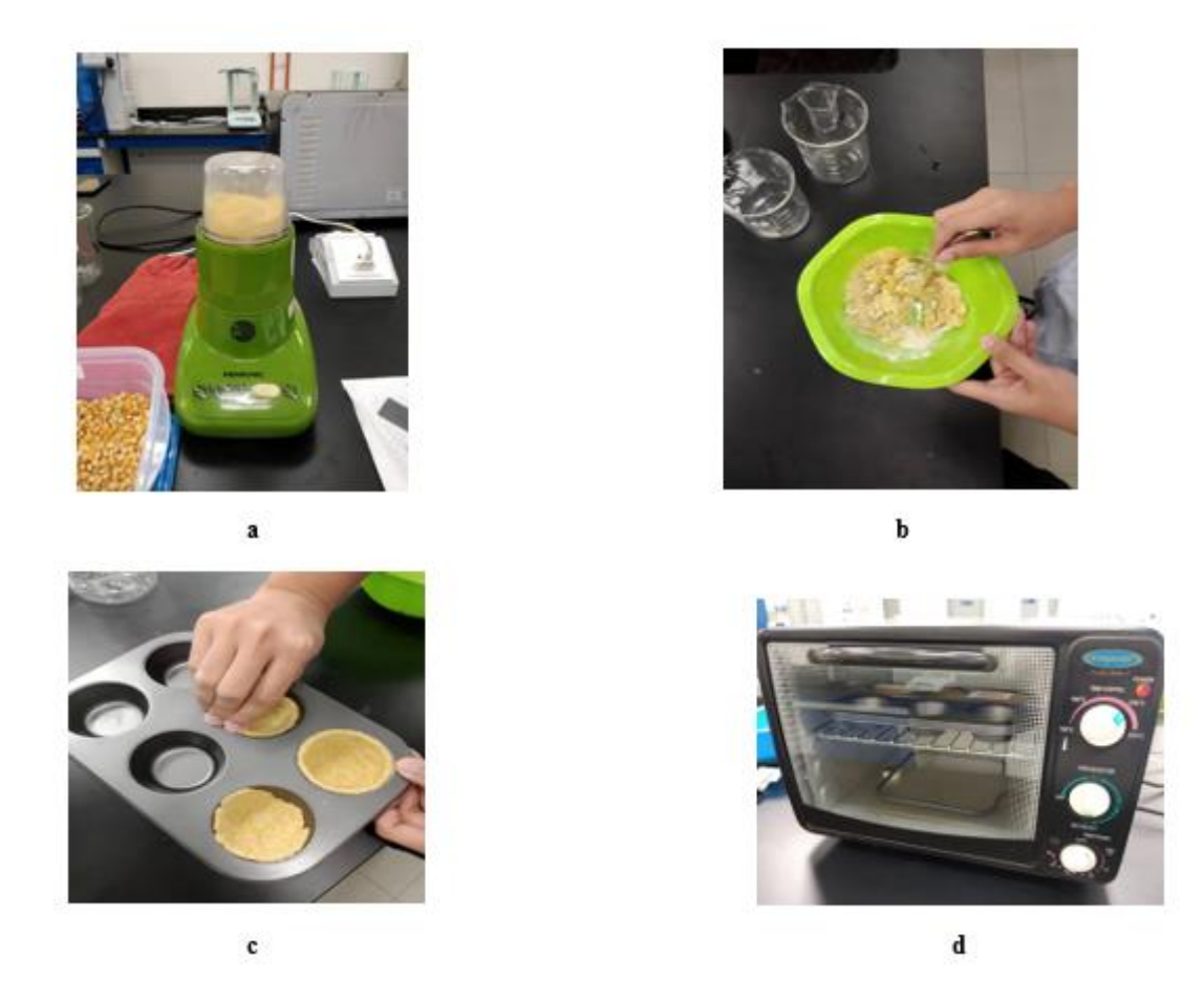
Figure 2: Process of the production

To ensure that the production process of this biodegradable cutlery is runs smoothly, all the stated method needs to be done very clear with least of flaws. These are included five step of process which are grinding, mixing, compressing, heating and cutting. The process of making the biodegradable cutlery is started by grinding process. As the ratio of ingredient to water is 7:3 respectively. 140 grams of barley and corn are blended by using a dry blender and mix with 60 grams of water. By going through all these processes, six biodegradable cutleries in small-cup shaped size managed to be produce with total of 70 grams barley and 70 grams corns with 60 grams of water. The process to produce the biodegradable cutlery can be seen from Figure 2 : (a) grinding using dry blender, (b) mixing of raw ingredient with water, (c) compressing the mixture in a cup-shaped tray, and (d) heat treatment of the sample in the oven.