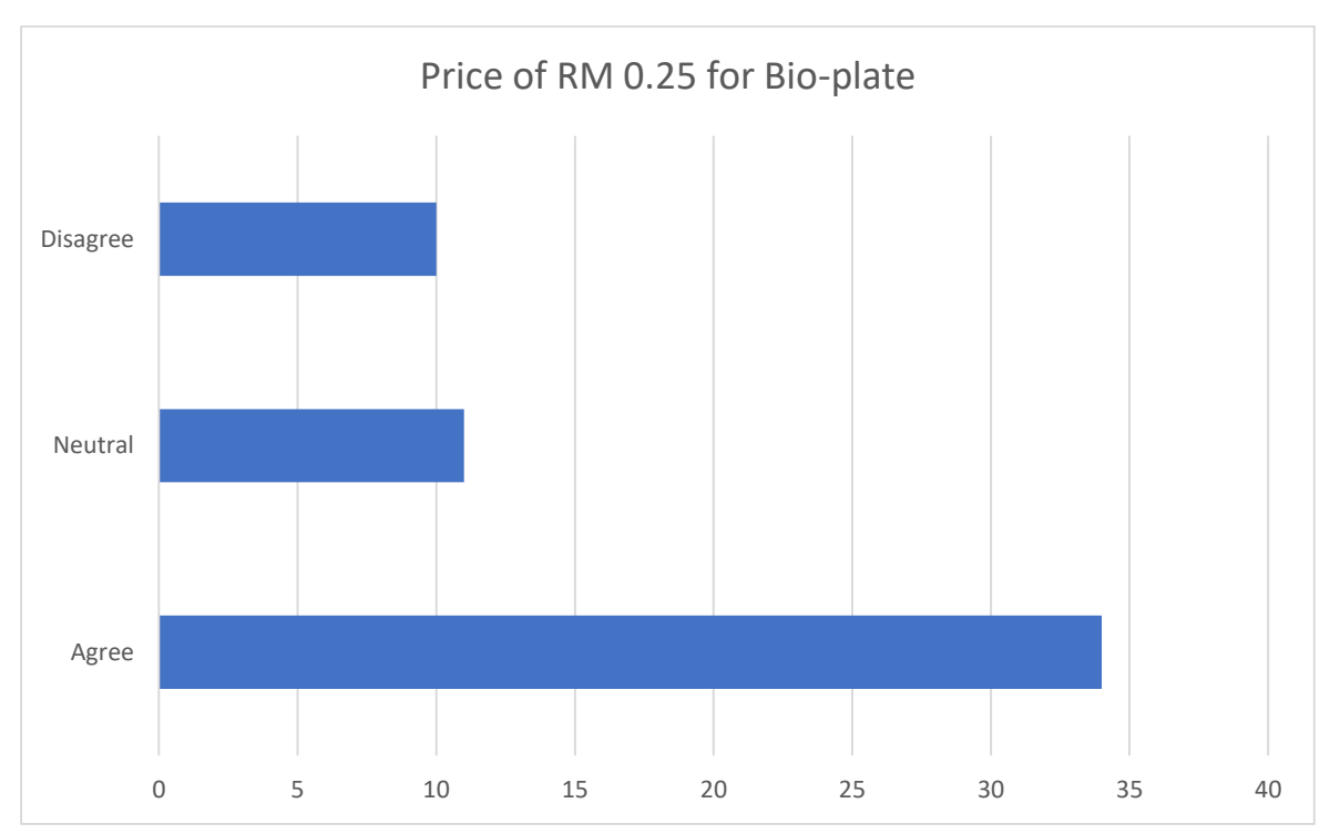
Figure 3. Results on the public opinion on the acceptance of the price given.

Recognition of Price, by calculating the price range, from the amount of raw ingredients being used, a single product of our biodegradable cutlery is weighed about 22.33 g and the final price for a single product is about RM 0.25. One survey had been done among the community to know either the price is reasonable to buy or not compare to plastic that cost Rm 0.10 and the result can be shown in Figure 3 . Majority of people has voted on "Agree" and the second most voted is on "Neutral". From the results, it can safely say that the result has been positive towards this biodegradable product.