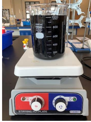
Figure 3: The preparation of stock solution

The parameters were analysed using UV-Vis Spectrophotometer to find the absorbance of methylene blue solution with wavelength of 565nm and the results obtained were recorded. The methylene blue adsorption capacity was obtained by using the general formula: