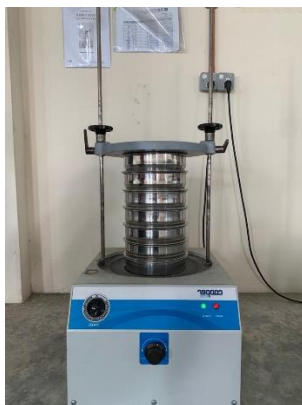
Figure 2: Adsorbents were sieved in the mechanical sieve shaker

The stock solution was prepared by dissolving 1 gram of methylene blue in 1000 mL distilled water to make a stock solution of 1000 mg/L as shown in Figure 4 and diluted into 10, 20, 30, 40, 50, 60 mg/L to obtain calibration curve using UV-Vis Spectrophotometer. The concentration of 50 mg/L was used as the sample for each parameter analysis.