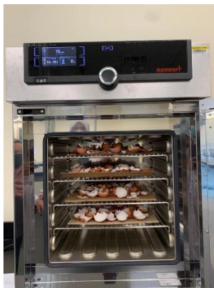
Figure 1: Adsorbents were dried in the oven

The eggshells were washed then dried under the sun and in the oven to eliminate moisture in eggshells, as shown in Figure 2 . Based on the objective, there are two experiments will be done. Therefore, the eggshells are divided into two parts, i.e., for the adsorbent dosage and particle size experiment. The eggshells were weighed using analytical balance to get the necessary adsorbent dosage to be used in the adsorbent dosage experiment. Figure 3 shows the eggshells crushed using a mortar and transferred into a mechanical sieve shaker to obtain the particle size needed for particle size experiments.