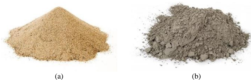
Fig. 1 Mortar mixture material (a) sand, (b) cement

In contrast to concrete, mortar only requires three ingredients: cement, sand, and water. A common mortar ratio is 1:3. Sand is ranges in size from 4.75 mm and smaller. Although the type of cement used for mortar application differed depending on the locale, OPC is still widely utilized in building. In terms of the water ratio, it is lower than the 0.40-0.45. In this investigation, sand and cement are shown in Fig.1. When mixing mortar, fine aggregate is added in a 1:3 ratio to cement.