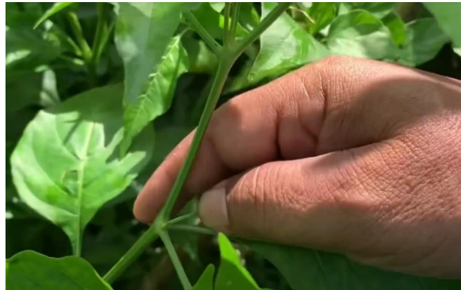
Fig. 2 The thumb moves horizontally to pluck the chili

The method we use is to pluck the chili by using the mechanism of a hair clipper. This is because the hair clipper cuts the hair with a blade that moves horizontally, the same as the mechanism of plucking chilies used by farmers. The farmers pluck chilies with their thumbs that move horizontally. Fig. 2 illustrates the pepper picking method, where a V-shaped cutter with a specific design shape selector is employed. Data collection involves determining the fracture rate from the bottom or from an appropriate angle based on the branch and the size of the fruit stem.