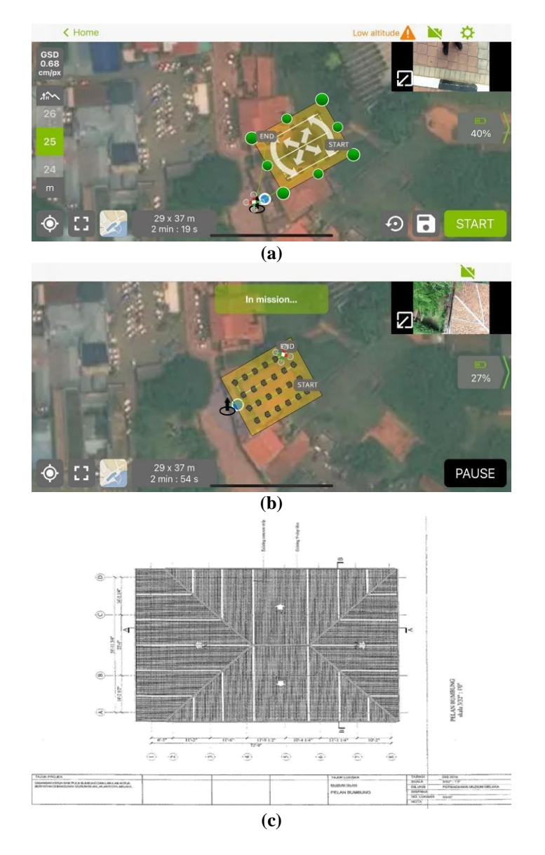
Fig. 1 (a) Area taken from the roof (b) Drone's route on the roof (c) Roof plan