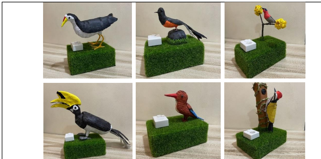
Fig. 2 The avian sensory kit developed in this study

Auditory components included high-quality recordings of avian calls and songs, downloaded from trusted online resources and edited for maximum clarity. These auditory materials were embedded in portable audio devices with user-friendly controls, allowing visitors to explore the avian soundscape in parallel with the tactile models. Taken together, the avian models and sounds created an integrated, accessible educational tool that highlighted the species' morphological features, behaviours, and ecological roles, thus fostering a deeper engagement with nature for participants who are visually impaired or have low vision. Fig 2 shows the avian sensory kit developed in this study.