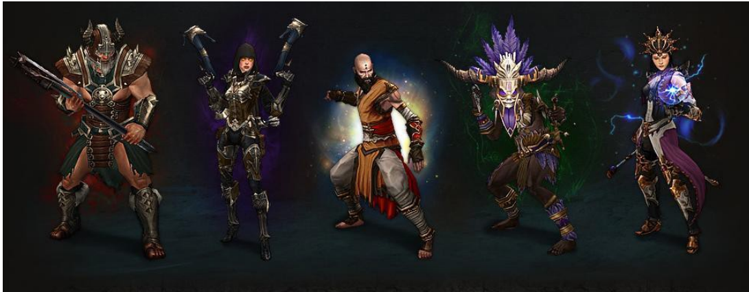
Fig.4 - Avatar in Diablo III © 2016 Blizzard Entertainment, Inc.

As such, it can be claimed, over the time the virtual characters have evolved from simple less detailed characters such as Pac-Man to intelligent and autonomous detailed characters that can be found in digital games. Adding to that, with each newly designed digital character, the boundary between reality and virtual reality is becoming scattered. In consequence, this method and technology is being spread into virtual academia whereby, usage of avatar in virtual learning has peaked over the last decade. Many refer avatar as pedagogical agent in virtual learning as it is claimed to be a fancy word for characters in e-learning (Kapp, 2014).