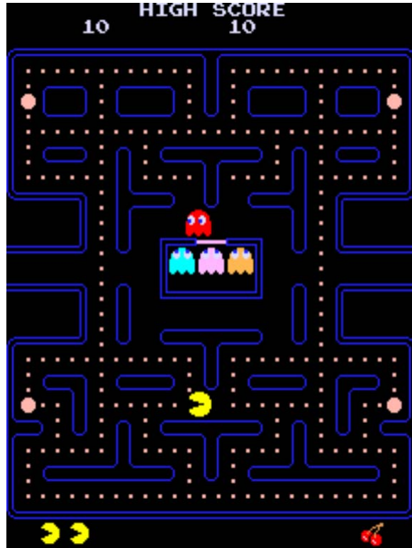
Fig.2 - Man by NAMCO BANDAI Games America Incorporation

This development continued till users interact with embodied virtual characters such as avatars in multiplayer online games, interactive chat bots and embodied pedagogical agents in virtual tutoring (Fig.3 and Fig.4) (Haake, 2009).