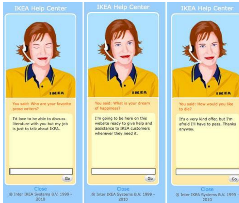
Fig.3 - IKEAs chat bot Anna in inter IKEA systems B.V

This development continued till users interact with embodied virtual characters such as avatars in multiplayer online games, interactive chat bots and embodied pedagogical agents in virtual tutoring (Fig.3 and Fig.4) (Haake, 2009).