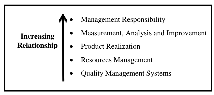
Figure 3: Ranking for the Requirements of MS1900:2005 in Enhancing Organization Performance

According to the correlation analysis (Table 11) and multiple regressions analysis (Table 13(b)) between Management Responsibility and enhancement of organization performance scored the highest. The respondent positively agreed that among all those requirements (Quality Management System, Resources Management, Product Realization, Measurement, Analysis and Improvement), the requirements of Management Responsibility related closest with enhancement of organization performance. The researcher believed that respondents referred to the role and responsibilities that have been played by management towards the success on the implementation of MS1900:2005. The other requirements also very important in MS1900:2005 but it's not the best requirements for the organization on enhancing their organization performance.