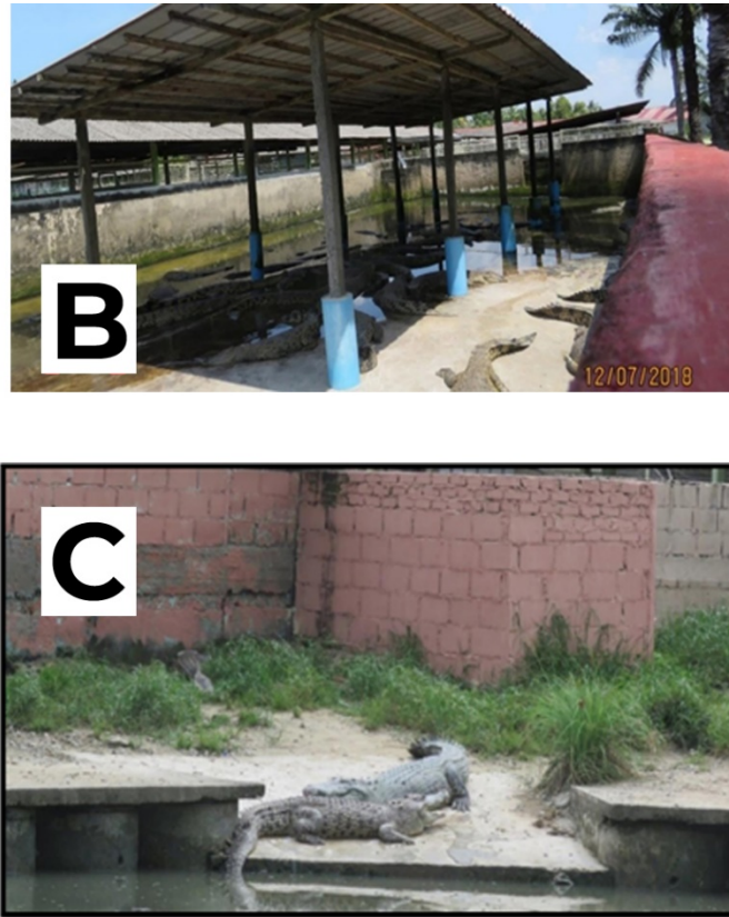
Fig. 2 - Non-breeding pond (Pond B) and breeding pond (Pond C) inhabited by C. porosus in Teluk Sengat Crocodile Farm