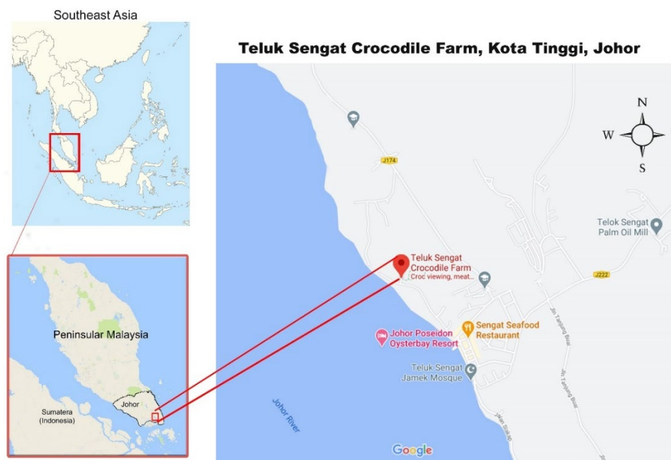
Fig. 1 - Location of Teluk Sengat Crocodile Farm, Kota Tinggi, Johor

This study was carried out in Teluk Sengat Crocodile Farm (1.5651066°N, 104.0241387°E) in Kota Tinggi, Johor (Fig. 1). There are more than 1,000 individuals live in the captivity. There are small size ponds measured approximately 150.743 m 2 (Fig. 2), two breeding ponds measured approximately 812.4779m 2 (Fig. 2), and 20 individual ponds measured approximately 30 m 2 big. Each pond has different number of crocodiles. However, only six breeding enclosure, 27 small enclosure and 37 individual enclosure were open to public. The other two breeding enclosure and ten small enclosures were restricted for the management purposes. This study was done simultaneously with feeding regime management study in another manuscript in the same volume.