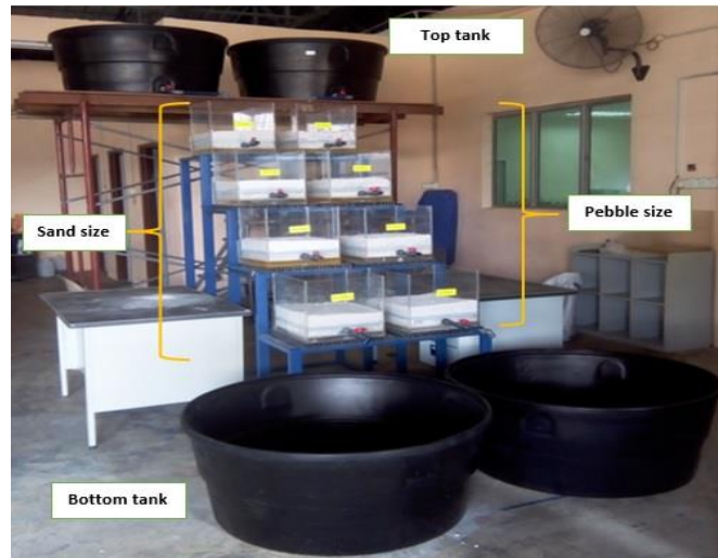
Fig. 1 - Marble column filter arranged according to size from coarser to finer as going down

is arranged stair-like using concept of cascade in which the flow is subjected to gravitational force as shown in Fig. 1. Flowrate of filter media was tested for each size.