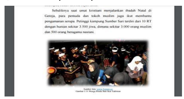
Figure 1. The Example of Multicultural in Indonesia

The needs integration of multicultural knowledge in the development of old Instructional materials can be described as follows: (1) multicultural knowledge becomes the liaison among basic competencies. (2) attaching multicultural values in all subjects. (3) Emphasizing multicultural values in the process of delivering materials, (4) exemplyfying multicultural values in arts for SBdP subject. (5) giving authentic photographs of multicultural cultures in Indonesia (example in Figure 1). (6) Giving additional multicultural values as supplement in the end of chapter which consist of nationalism, tolerance and unity in diversity.