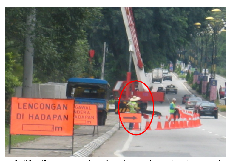
Figure 1. The flagman is placed in the road construction work zone

The ultimate aim of this research is to implement technological approach which will overwrite the conventional flagman practice. Revolution and modernization have introduced new technologies in assisting and ease human life in various ways. In order to reduce fatalities and injuries from crashes and to enhance smoothness in traffic operation as well as to ensure safety within work zones especially during road construction, an intelligent traffic light is essential.