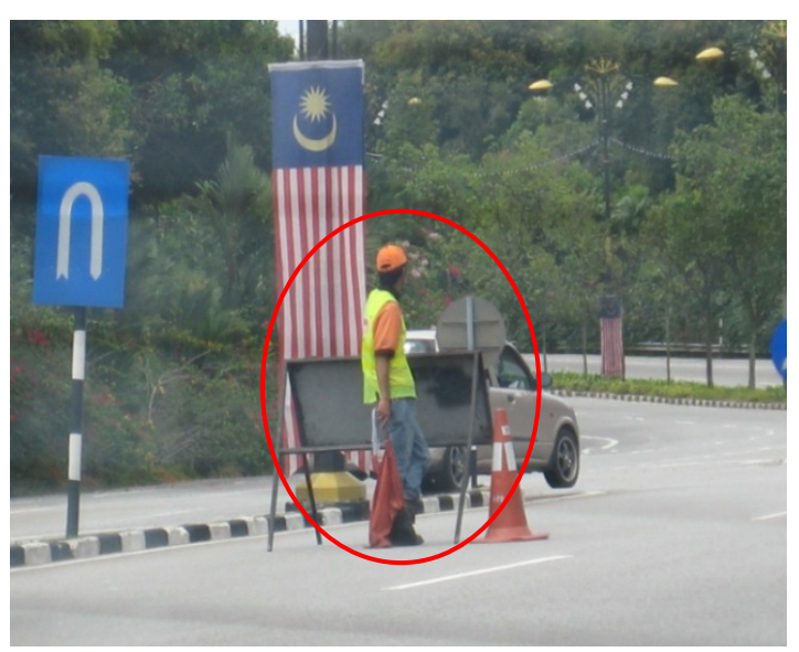
Figure 2. The flagman not conscious on his task

A perfect picture of a road construction site involves various activities whereby safety is always given high priority. The safety factor in a road construction site includes the workers and also the road users. Some cases have been reported that accident happens around the road construction site is mainly caused by reckless drivers. Studies clearly indicate that the reasoning behind these accidents shows that most drivers tend to ignore flaggers directions as published by DOSH [4]. Disobeying the flagman and speeding in a road construction site is serious and punishable which is finable or imprisonment if it results in a bodily injury accident.