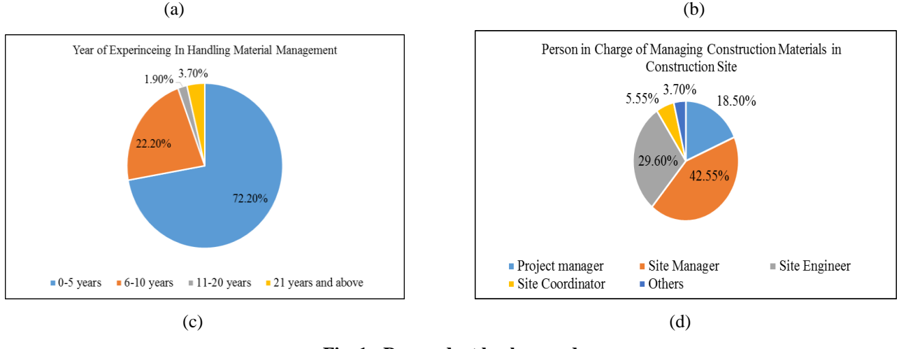
Fig. 1 - Respondent background.